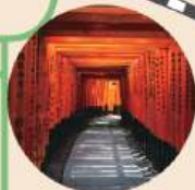
Fushimi Inari Shrine